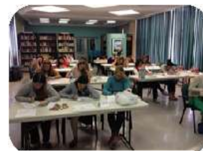
Students while completing the mock test as part of the workshop.