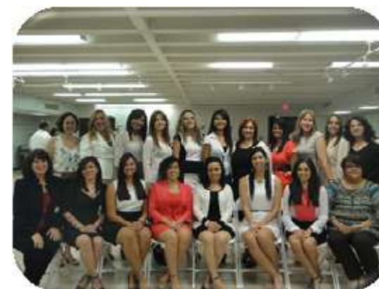
Students and mentors celebrating after a long research journey.

This year "research celebration" poster session was conducted on April 24, 2013. Fifteen research posters were presented during the evening. The enthusiastic crowd consisted of over 85 visitors including SUAGM IRB representatives, UT faculty, students, and family members. Congratulations to all students!