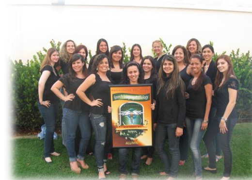
CLASS OF 2014